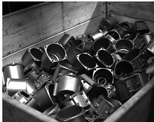
Figure 1: Randomly organized objects in a bin. An object is approximately the size of a coconut.

be segmented into interesting and uninteresting points. In section 3 we describe the invariant features and in section 4 we describe how to use these features for matching and pose estimation. In section 5 and 6 the results are presented and discussed, respectively.